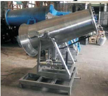
FIXED TYPE – ANTI SMOG GUNS