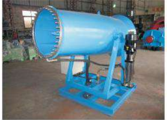
FIXED TYPE – ANTI SMOG GUNS