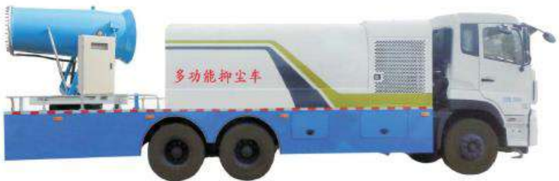
TRUCK TYPE – ANTI SMOG GUNS