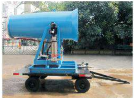
DRAG/TOWED TYPE – ANTI SMOG GUNS